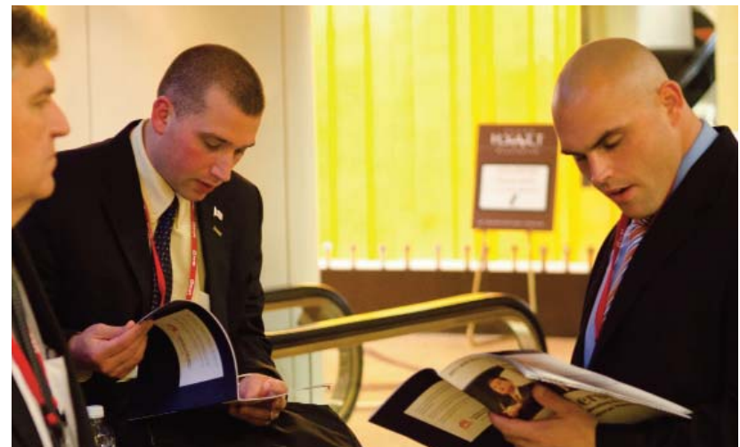
Conference attendees look over the conference program.