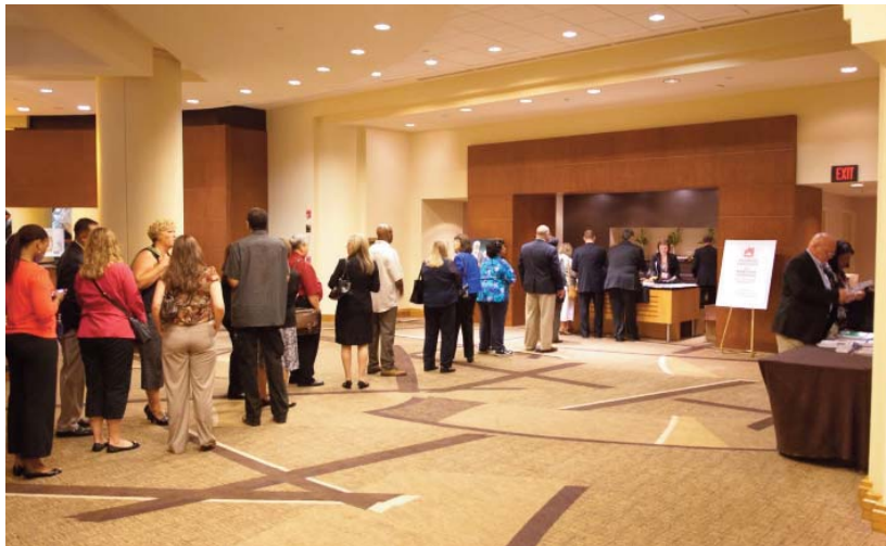
Conference attendees await check-in. This year's conference attendance was the highest in NCHV history.