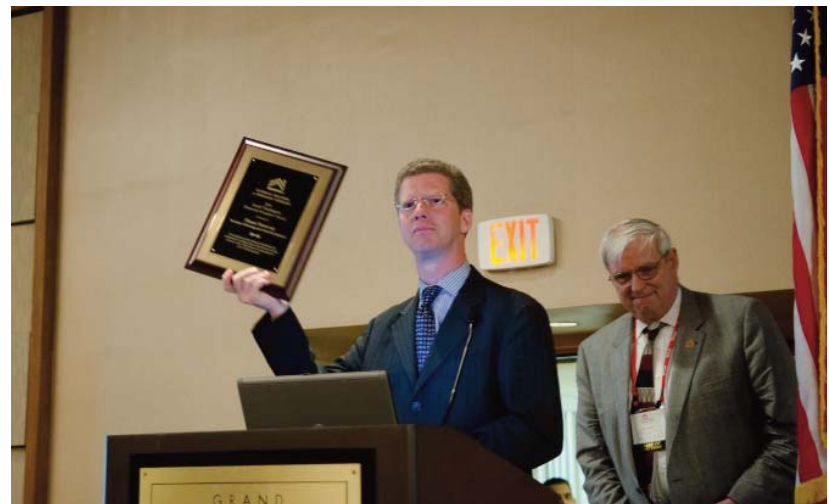
Secretary Donovan holds up the Jerald Washington Memorial Founders' Award, the highest honor bestowed by the homeless veterans assistance community. Donovan was presented with the award for his leadership in HUD's efforts to end veteran homelessness.