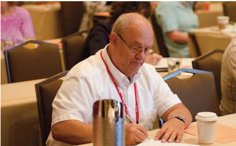
A conference attendee takes notes during a session on Wednesday morning.