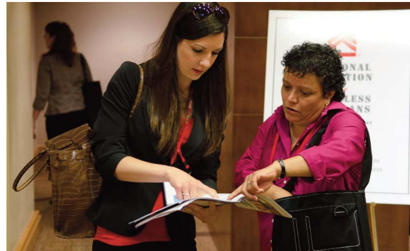
Attendees decide which sessions to go to. This year's conference featured 38 sessions during three days.