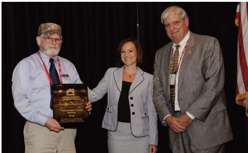
Central Oregon Veterans Outreach received the Outstanding Partnership Award for building a collaborative community in an extremely rural area with limited funding.