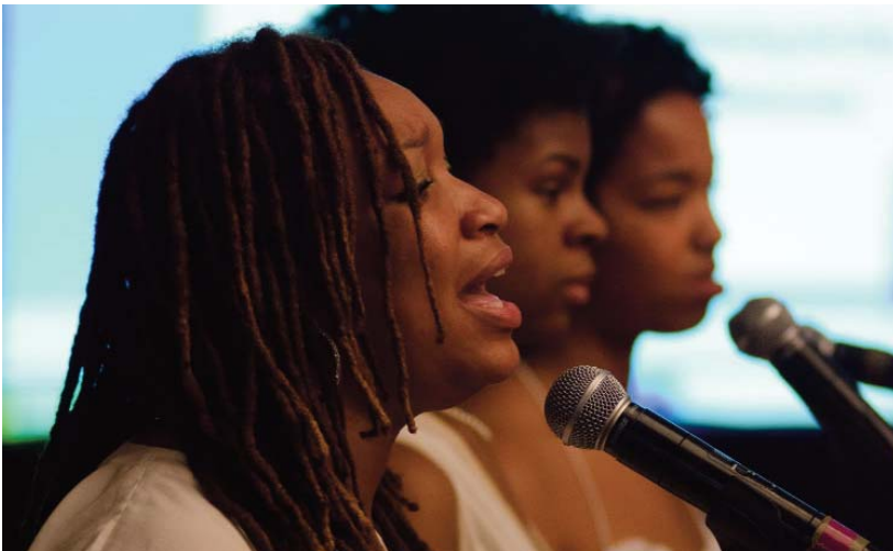
Alumni of the Duke Ellington School of the Arts performed the National Anthem as well as a patriotic medley to open the conference.