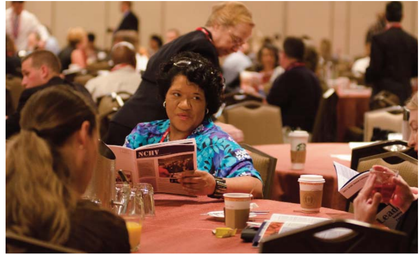
Attendees converse as they await the beginning of the Opening Session.