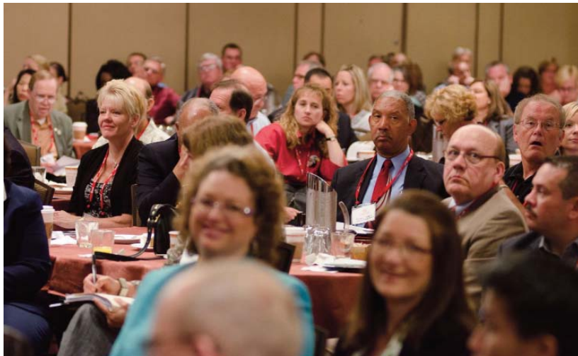
Conference attendees listen during the Opening Session.