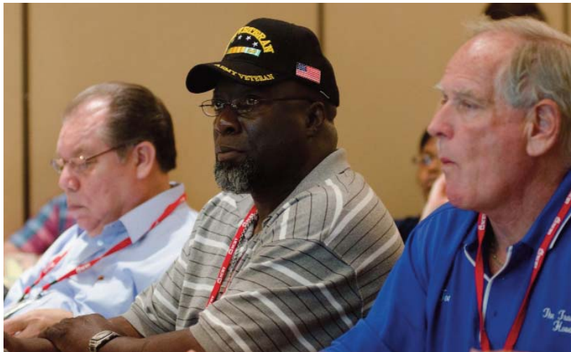
Conference attendees participate during a session.