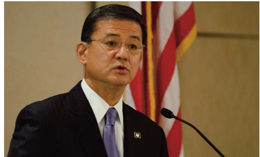
Secretary of Veterans Affairs Eric Shinseki addressed the Opening Session, giving an update on the Five-Year Plan to End Veteran Homelessness.