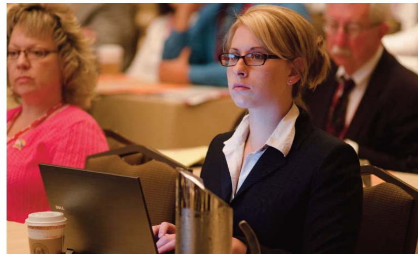
A conference attendee takes notes during a session.