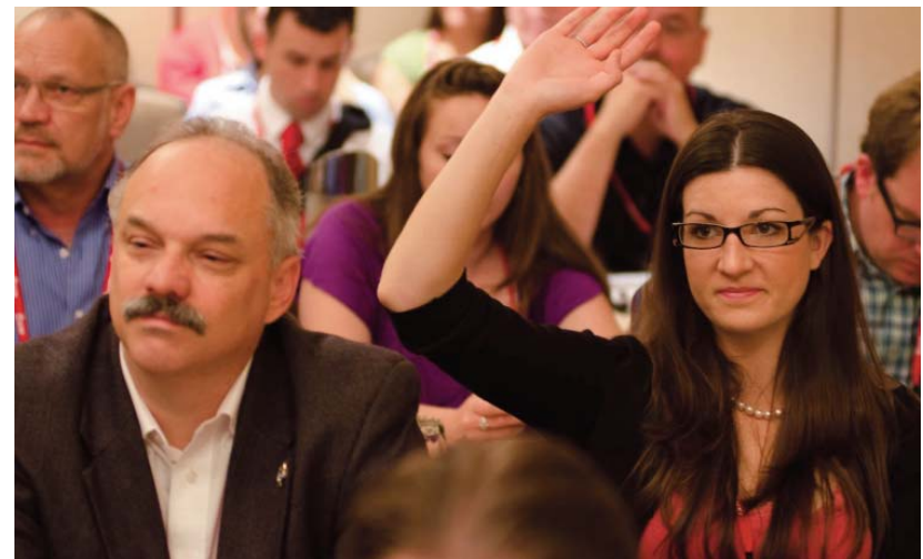
Attendees participate in a session on Wednesday morning.