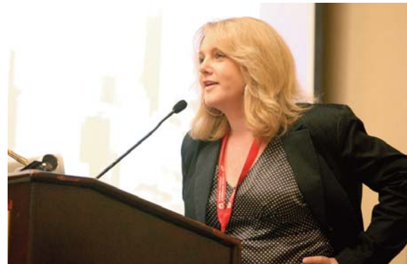
The 2010 NCHV Annual Conference featured 25 training sessions, and the annual awards banquet.